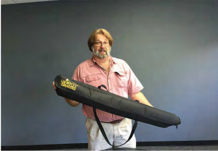
ShowFlex with padded travel bag.