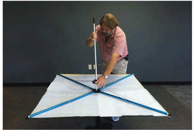
Push hub all the way to the bottom of the hinged leg.