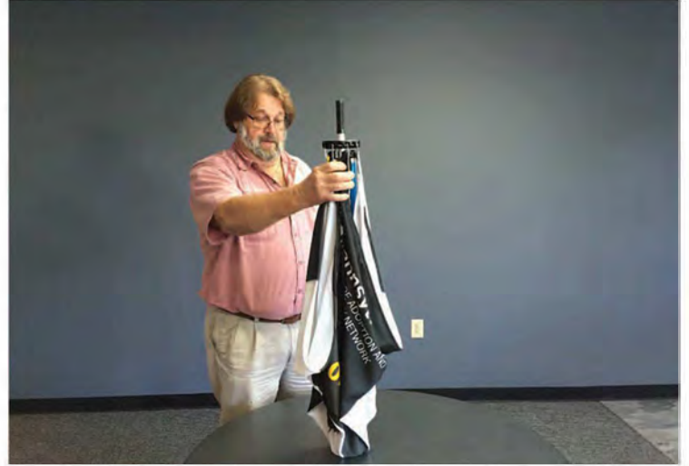
Stand ShowFlex upright on table