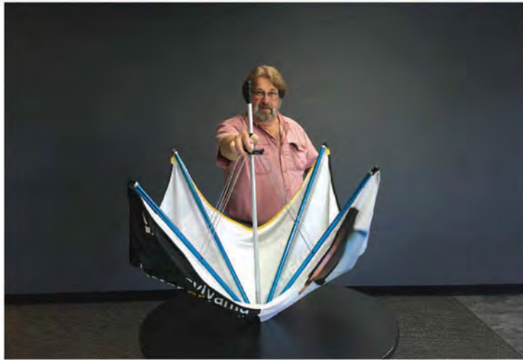
Push down on hub while unfolding the legs.