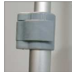
Close to secure