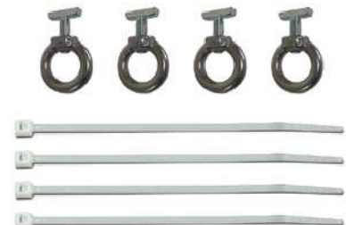
Back-Lit LED Ladder Light Mounting Kit Included