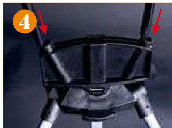
4. Place upper poles into slots