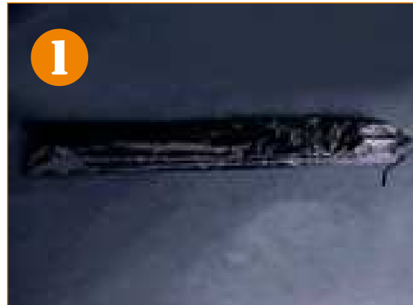
1. Place bag on the floor