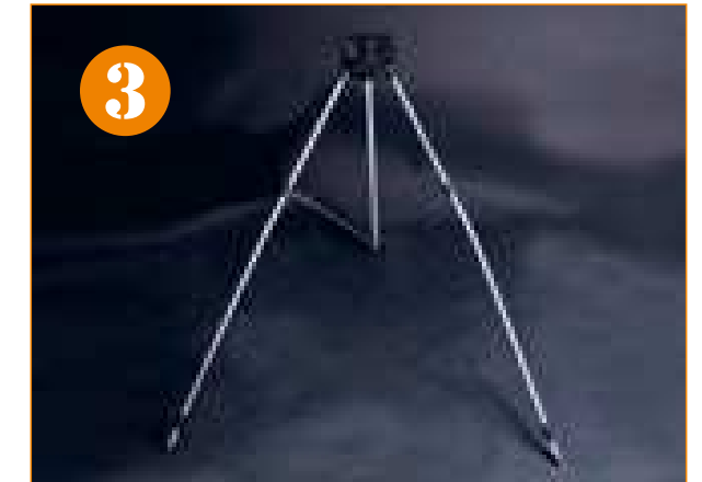
3. Remove bannerstand base from bag and extend legs