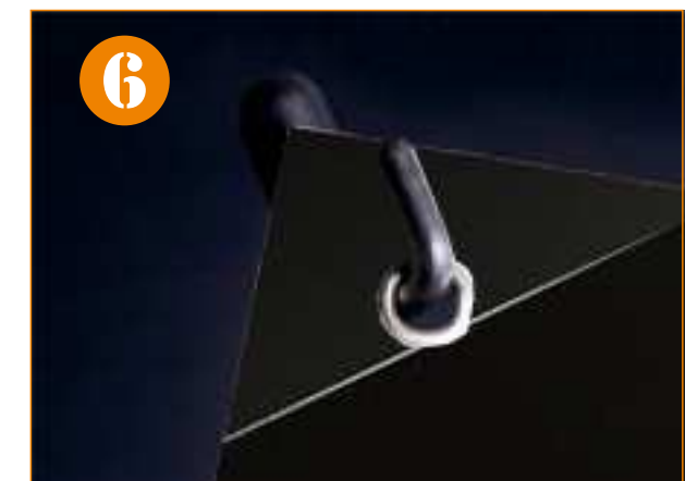
6. attach graphics to each corner