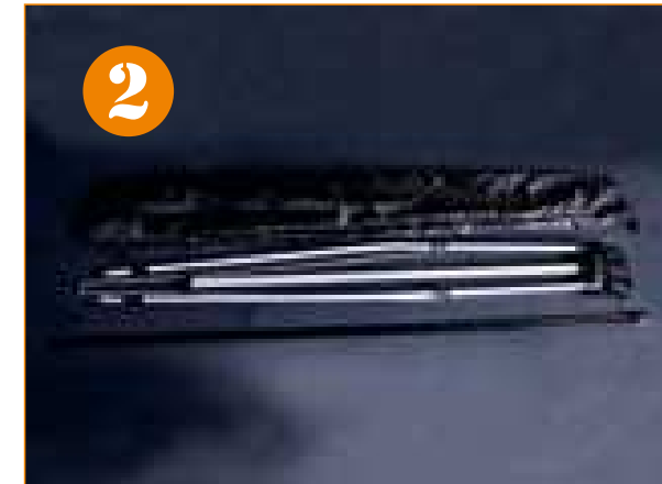
2. Unzip the bag