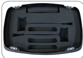
Foam padding for lights