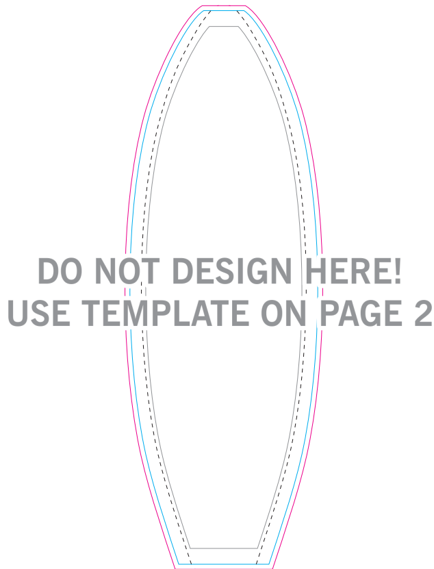
IMAGE SAFETY LINE: The GREY line shows the image safety line. Keep all text & important images inside the safety line or they might get cut off.

STITCHING LINE: The BLACK line shows the stitching line.