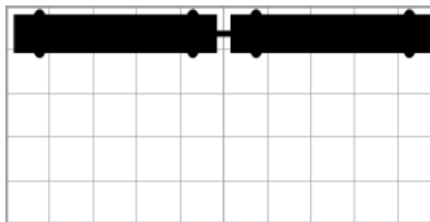
Aerial grid of 10' x 10' space