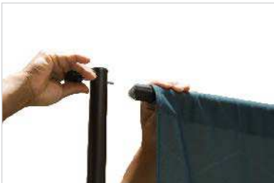
Clutch lock offers secure horizontal and vertical adjustments.