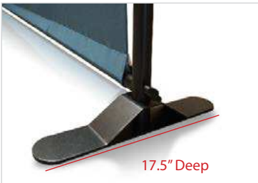
Sturdy Steel "Bridge" Support Base.

Graphic Turnaround Time is 2 business days for up to 2 sets