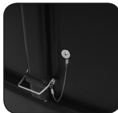
Close up of pin