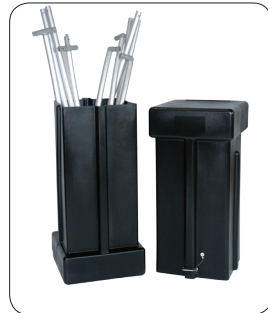
Case fits with Formulate tubes and graphics