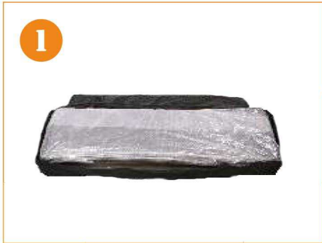
1. All of the components of the LBC1G are enclosed in the soft carrying case.