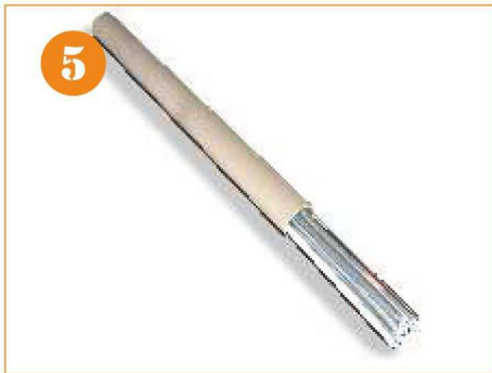
5. Take out the LED light