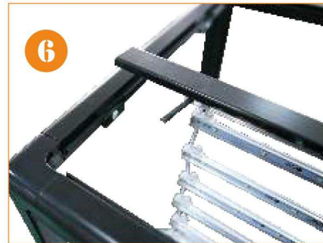
6. Hang the lights like this