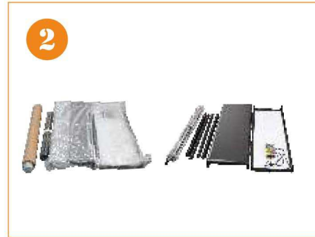
2. Take all the Components out of the bag.