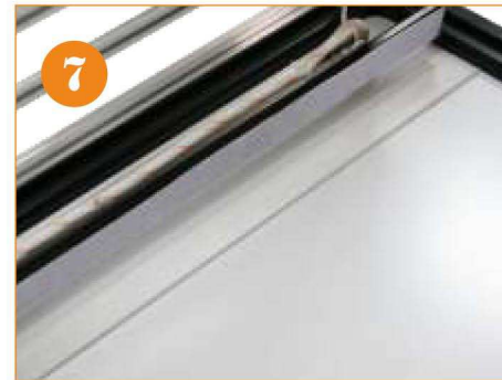
7. Attach the bottom aluminum bar's male to the velcro on the base