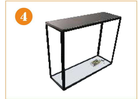
4. Put the top whole pcs on the 4pcs poles