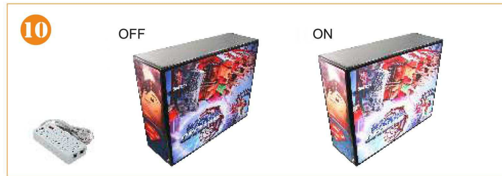
10. The finished light box should look like this