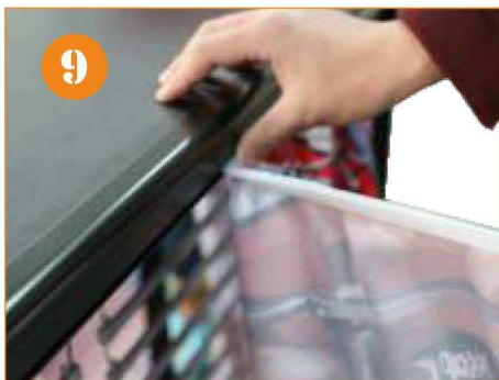
9. Install the graphic with silicon