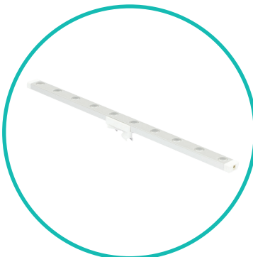
QTY 6: Edge Lights

Outside Dimensions: • 28" L x 6" W x 7 1/4" H Inside Dimensions: • 28 1/4" L x 6 1/8" W x 6 3/4" H