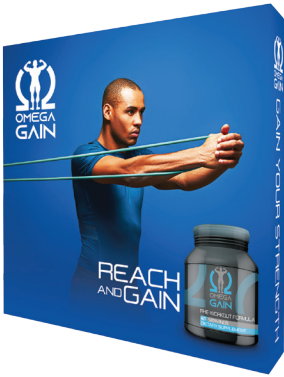
Non-Lit Front View