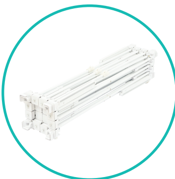
QTY 1: 3x3 Pop Up Frame

Outside Dimensions: • 35" L x 13" W x 10" H Inside Dimensions: • 35" L x 13" W x 10" H