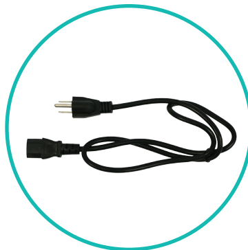
QTY 3: Power Cords

• 5 1/8" L x 2 1/4" W x 1 1/4" H (Transformer) • 58" L (Cord Length)