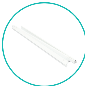
QTY 8: 3 Sectional Channel Bars

• 34 1/8" L x 6 1/2" W x 7 1/4" H (Collapse Frame)