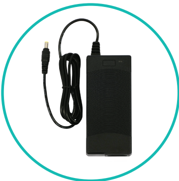
QTY 3: Transformers

• 5 1/8" L x 2 1/4" W x 1 1/4" H (Transformer) • 58" L (Cord Length)