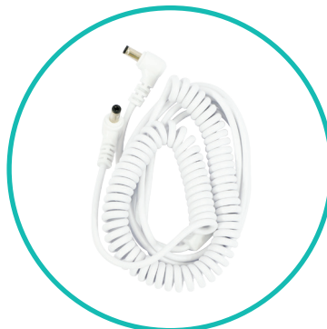
QTY 3: Edge Light Jumper Cords