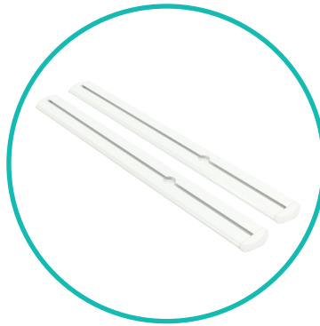
QTY 2: Stabilization Feet