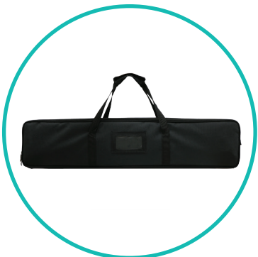
QTY 1: Edge Light Travel Bag

Outside Dimensions: • 28" L x 6" W x 7 1/4" H Inside Dimensions: • 28 1/4" L x 6 1/8" W x 6 3/4" H