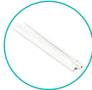
QTY 4: 4 Sectional Channel Bars