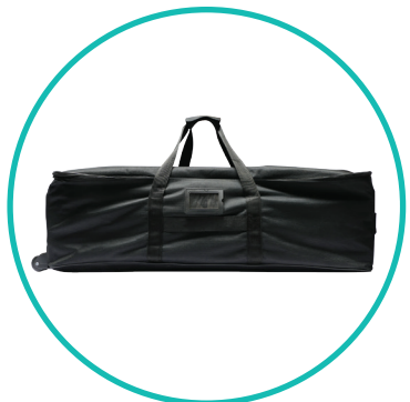
QTY 1: Travel Bag with Wheels