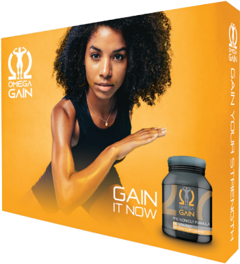
Non-Lit Front View