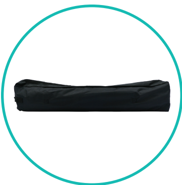
QTY 1: Channel Bar Bag