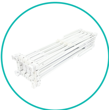
QTY 1: 4x3 Pop Up Frame