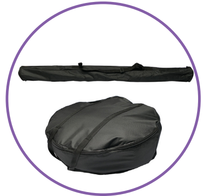
QTY 2: Travel Bags