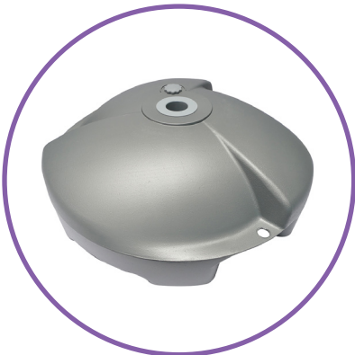
QTY 1 Base