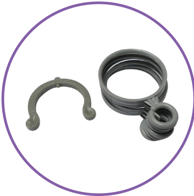
QTY 9: Ring Clips