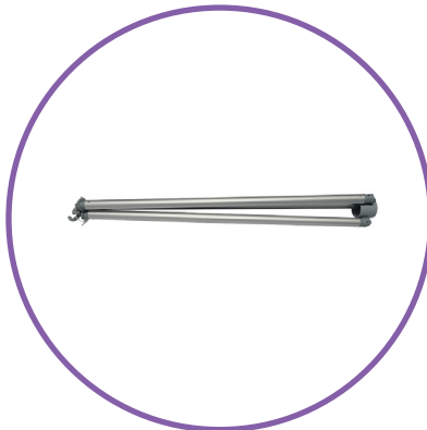
QTY 1: Support Legs