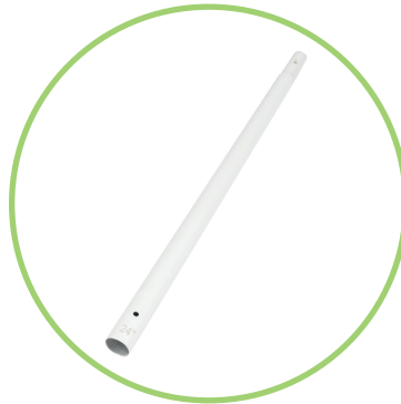
QTY 2: 24" Tubes