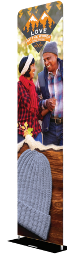
Double-Sided Back View