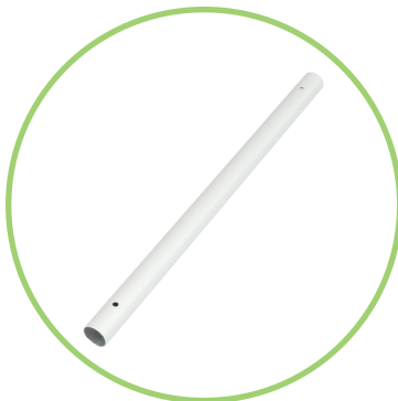
QTY 1: Horizontal Bottom Tube