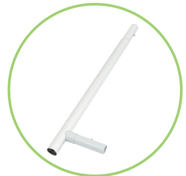
QTY 2: 20" Bottom Tubes