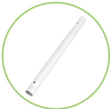
QTY 6: 12" Tubes