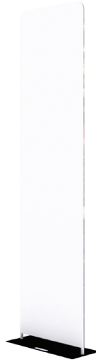
Single-Sided Back View