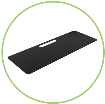
QTY 1: Steel Base