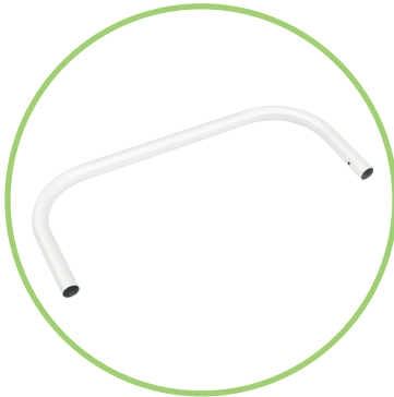
QTY 1: 24" Top Tube