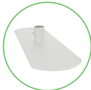
QTY 2: Feet