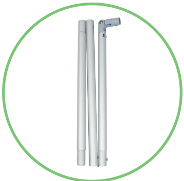
QTY 2: Vertical Tube Sets