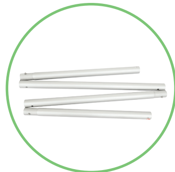
QTY 1: Top Horizontal Tube Set