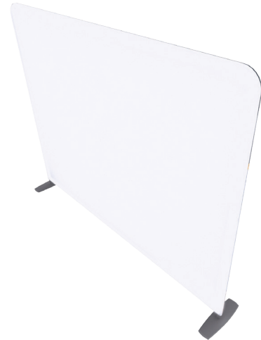
Single-Sided Back View