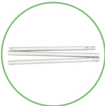
QTY 1: Bottom Horizontal Tube Set