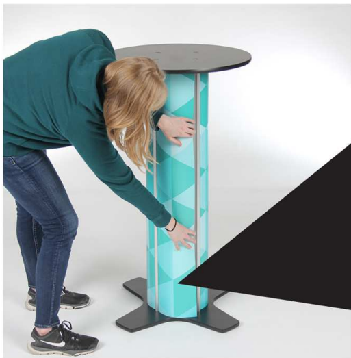
Insert graphics into outer channels of poles.