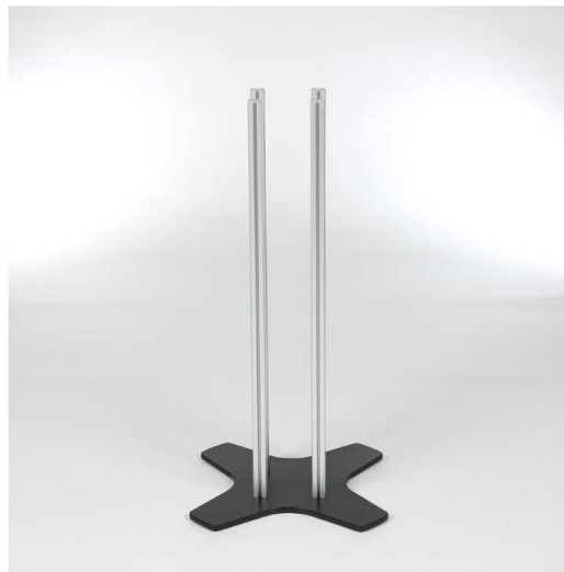
Once all four poles are attached to base, place table upright.