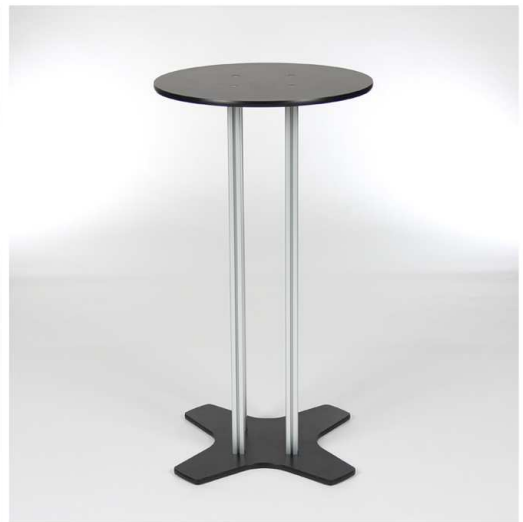
Next, attach table top to poles with bolts & Allen wrench.