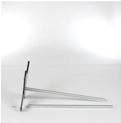
Attach poles to base with bolts & Allen wrench from below.