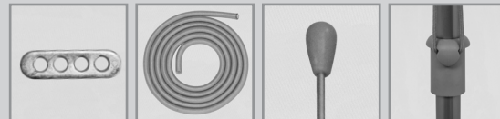
Bungee Cord Tensioner

NOTE - THE AMOUNT OF POLES ARE DETERMINED BY THE SIZE OF THE BOWFLAG®