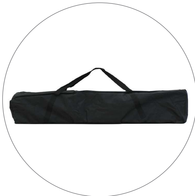
(qty 1) Travel Bag