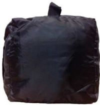
Optional Sand Bag