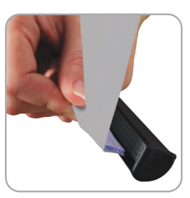
* NEW rails accept silicone-edge fabric graphic

We are continually improving and modifying our product range and reserve the right to vary the specifications without prior notice. All dimensions and weights quoted are approximate and we accept no responsibility for variance. E&OE. See Graphic Templates for graphic bleed specifications.