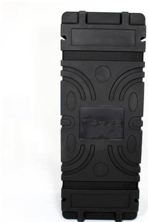
Wheeled Case (included)