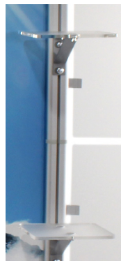
Acrylic Shelves (included)