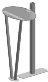
Acrylic Table (included)