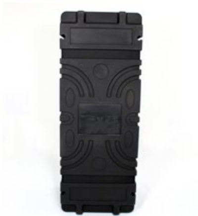
Wheeled Case (included)