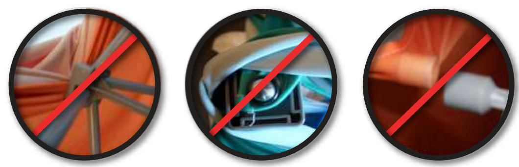
Covered by U.S. Patent No. 7, 191, 555. Foreign and domestic patents pending.

Watch for snagged skins, before and during set-up