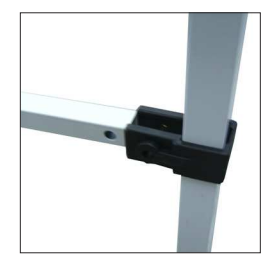
Step 2 Remove stabilizing bar from Molded Plastic Connectors.