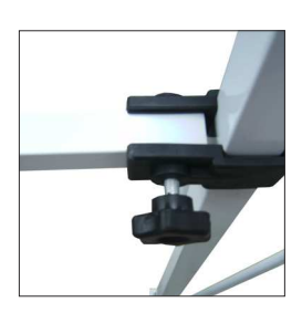
Step 1 Remove both Large Bolts with Plastic