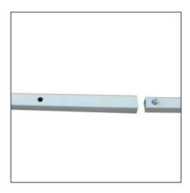
Step 3 Disassemble stabilizing bar by pressing in push button on the Large Bar and sliding it out of the Short