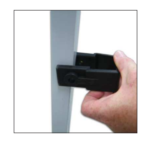
Step 4 Remove Molderd Plastic Connectors from tent legs.