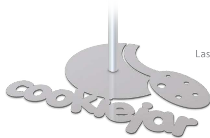
Laser cut logo bases

Custom bases, logos, plaques, headers with Perflex Pedestal Sign Frames™ to fulfill market opportunities tastefully.