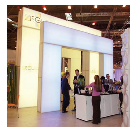
Build Free-standing exhibits using DeltaFabric System 2

Build large exhibits with walls up to 8' wide by any length... DeltaFabric System 3 allows attachment of fabric graphics to front and back of frame.