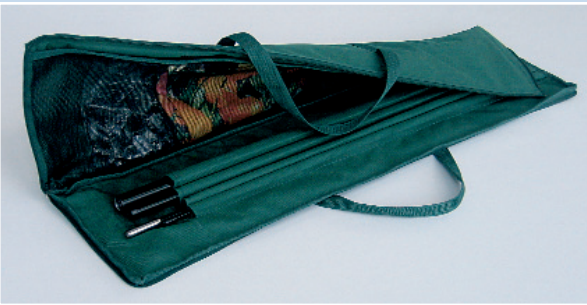
Optional Carrying Case for safe and easy transport and storage. Made of durable polyester with separate interior pouches for all parts.